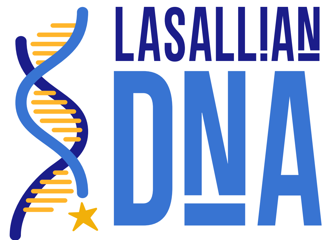
a. Basic logo