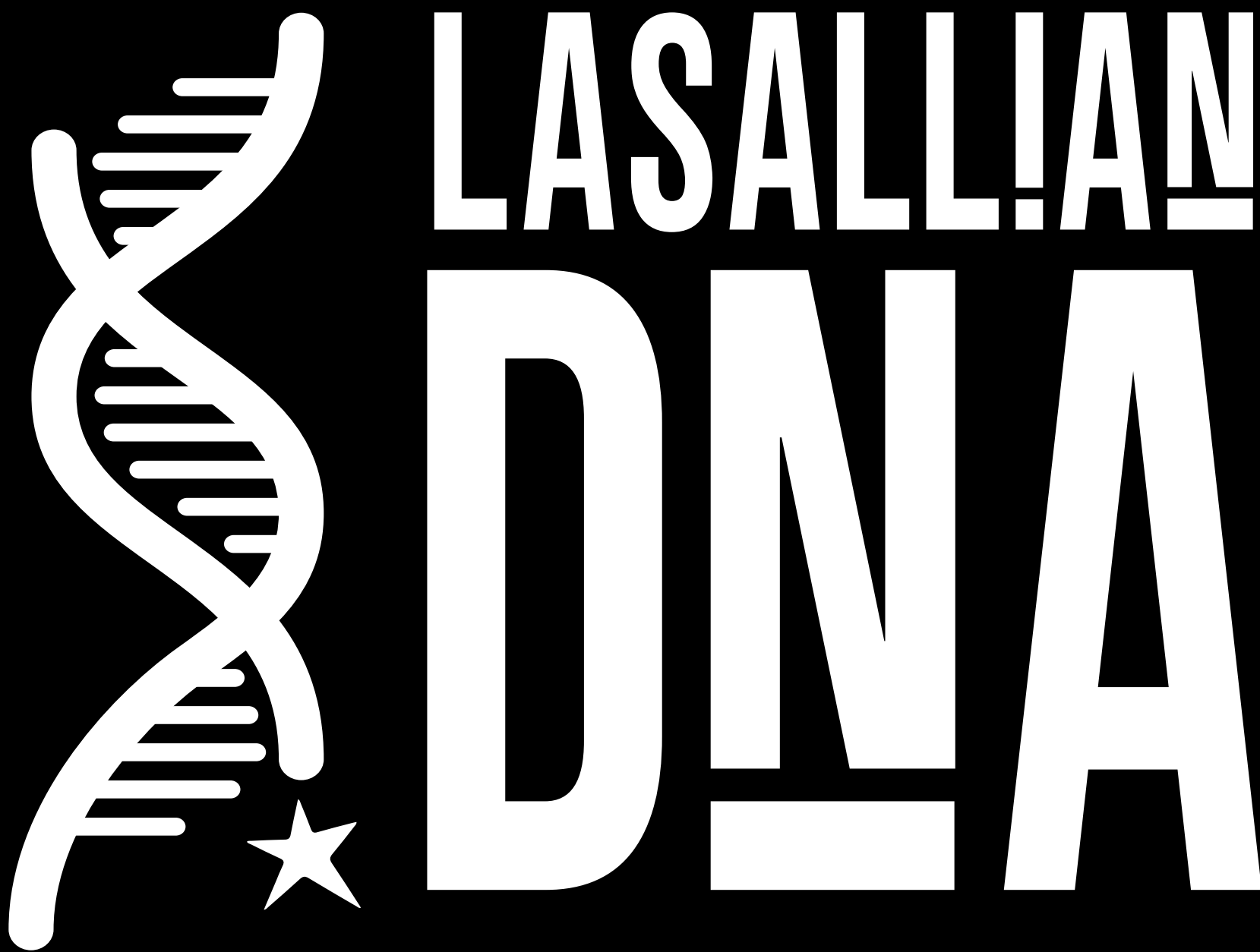
White Negative Logo